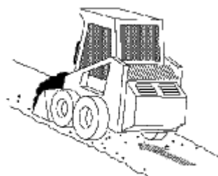
Loader going up