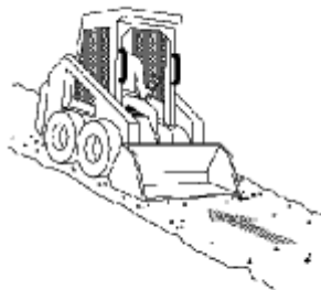
Loader going up

Fact sheet confirmed current: 2022-07-26