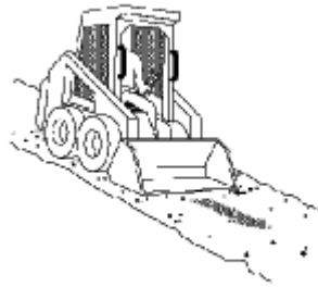
Loader going down