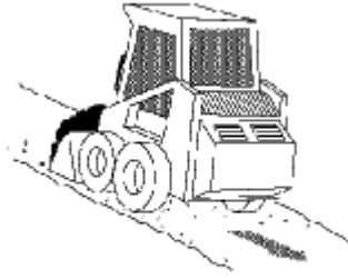
Loader going down